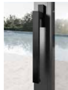
LIFT & SLIDE EDITION