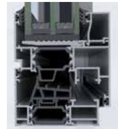
Level 1 Uf: \geq 1.8 W/m 2 K