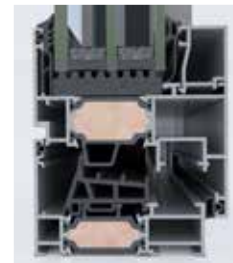
Level 3 Uf: \geq 1.1 W/m 2 K