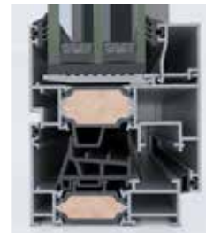
Level 2 Uf: \geq 1.2 W/m 2 K